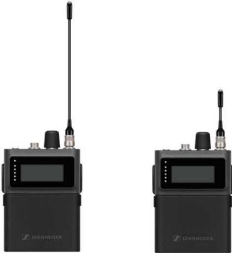
SPECTERA SEK (UHF)